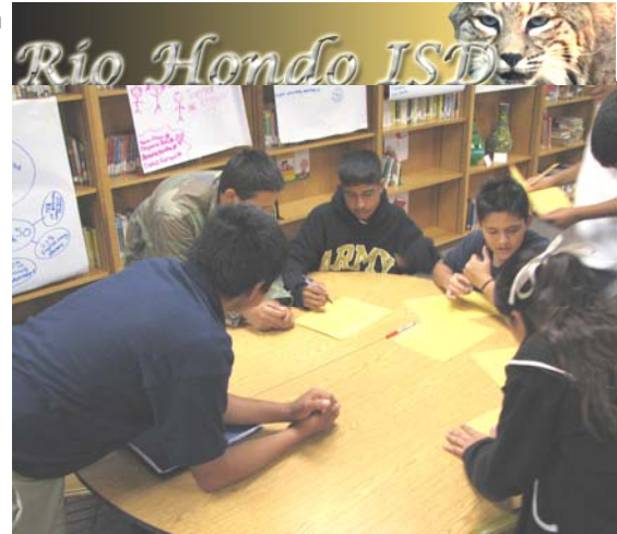
Rio Hondo GEAR UP students participate in advisory lessons.

make a lasting impact, more so than a piece of paper handed out for them to read at their own leisure."