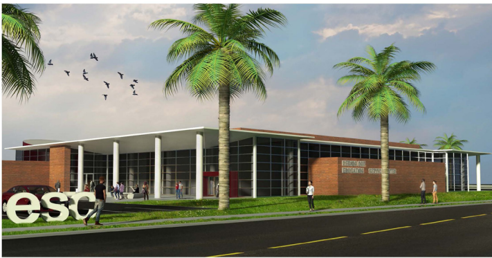
Region One ESC – CONCEPTUAL RENDERING