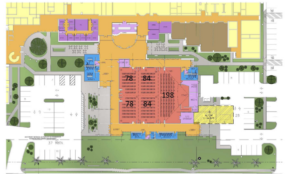
Region One ESC – Floor Plan