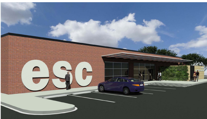
Region One ESC – Conceptual Rendering