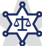
Law and Public Service