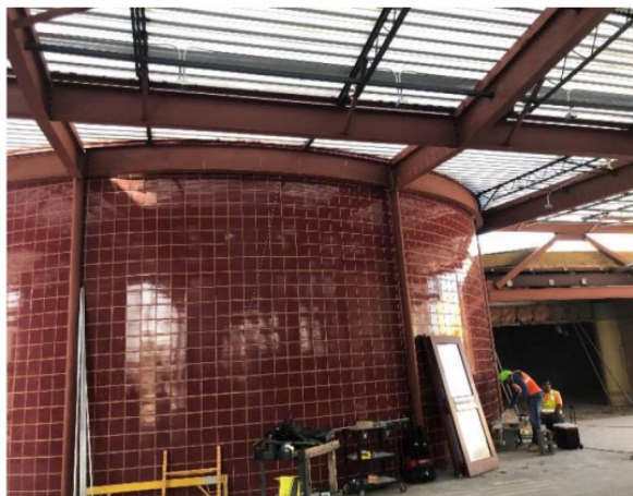
Edinburg Construction Project: New concourse at existing rotunda.