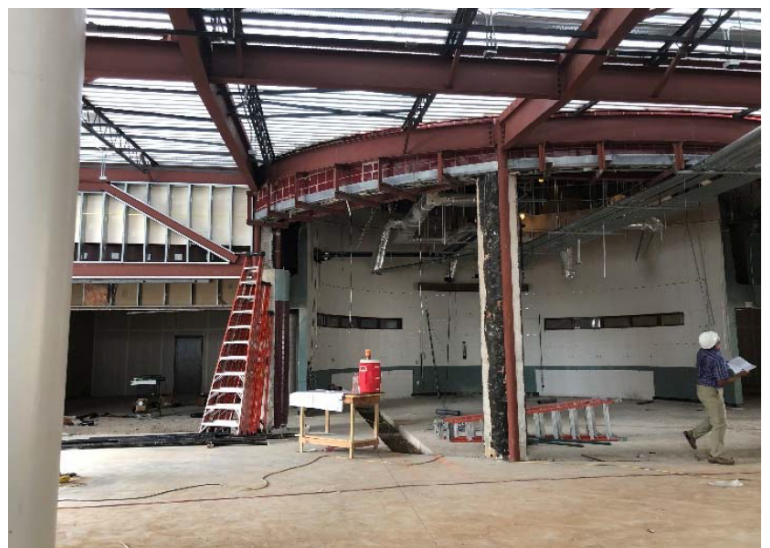
New concourse at existing rotunda